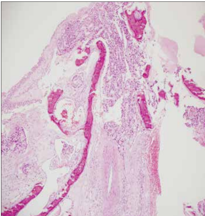
Figure 2. Prostatic adenocarcinoma metastasis is seen under paranasal sinus mucosa (HE x200)