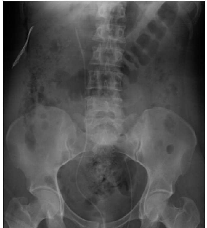
Figure 3. A 5-Fr ureteral catheter was left in the kidney

A 39-year-old female patient presented to our clinic with right renal colic. Her laboratory test results were as follows: urea 22