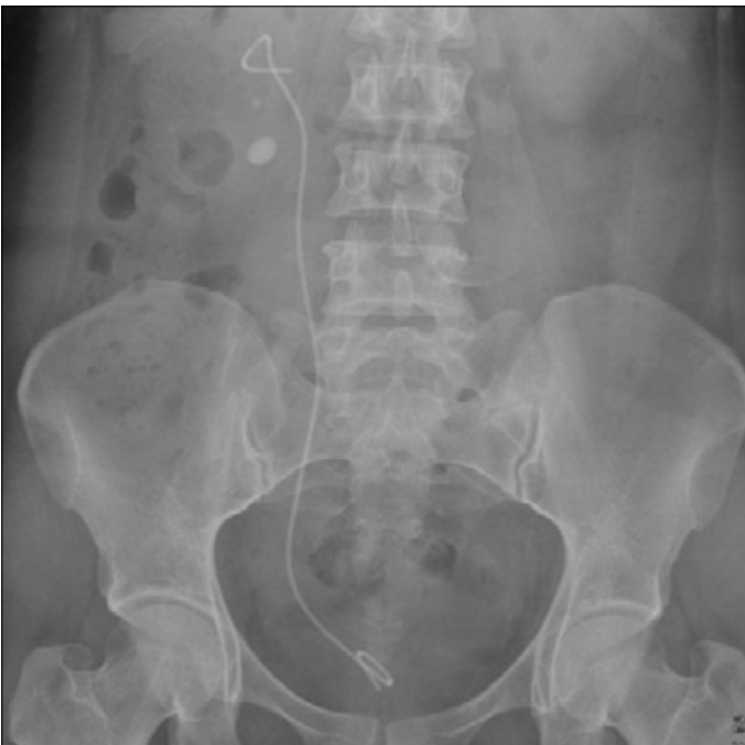
Figure 2. KUB radiogram obtained on postoperative day 1 revealed 2 stones in the lower pole KUB: kidney-ureter-bladder