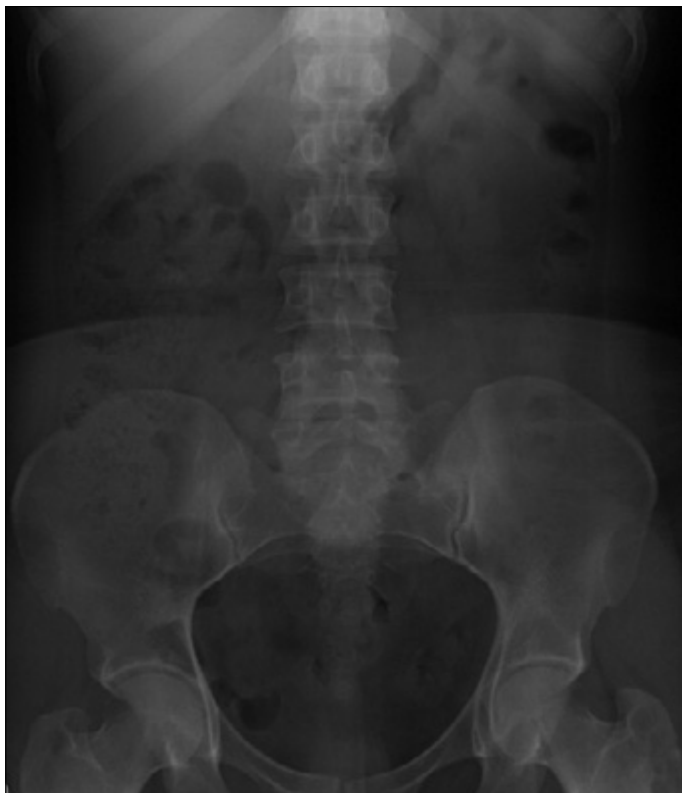
Figure 4. Stones were completely fragmented and removed from the kidney

blurring bleeding occurred. The patient's hemoglobin levels were 12.9 mg/dL on postoperative day 1. Because she did not manifest any signs of gross hematuria, her ureteral catheter was removed on postoperative day 1 and she was discharged without any postoperative complication (Figure 4).